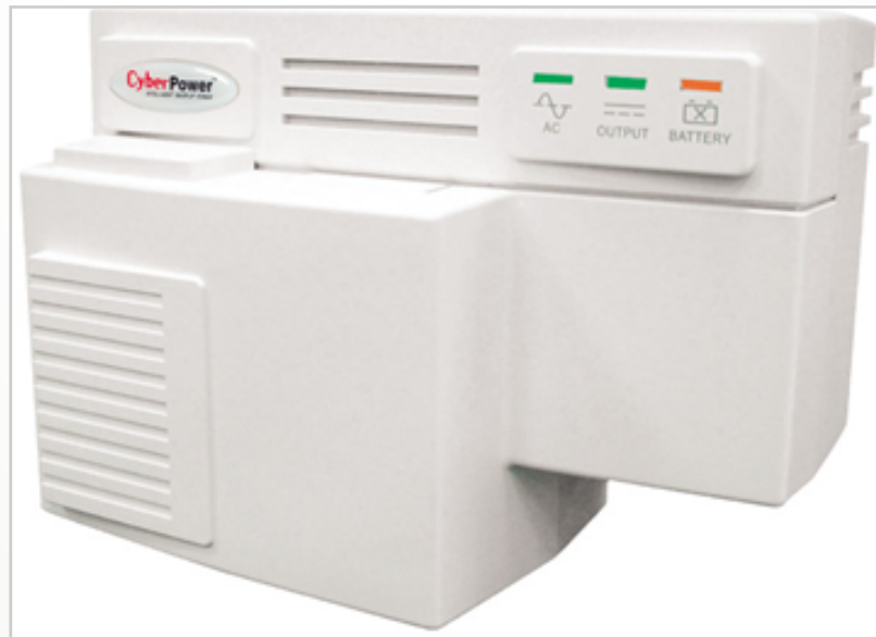
Front View of CYBERPOWER UPS provided by NAYAtel