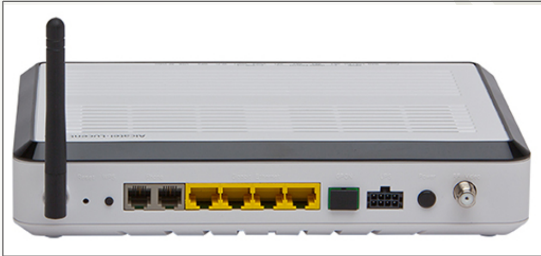
Alcatel GPON (I-241W-S)

The following figure show the back side of ONT when you can observe the different ports for Ethernet, POTS and RF-TV. Also remember the ports' numbering is from right to left like the Ethernet port nearer to power port is Ethernet Port#1