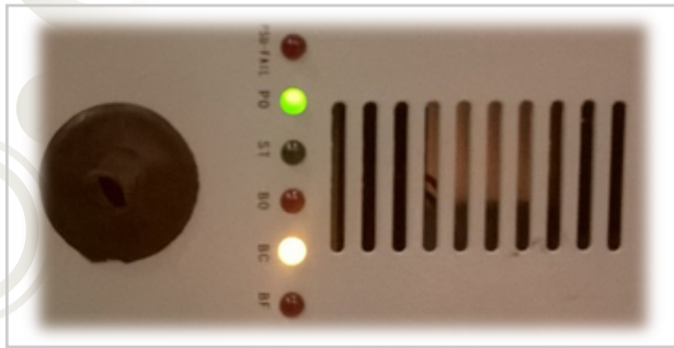
ON LEDs on side panel of NAYAtel 70W UPS