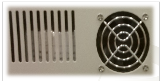
FAN on rear panel of NAYAtel 70W UPS