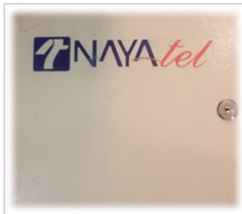
Front panel of NAYAtel 70W UPS (with lock)