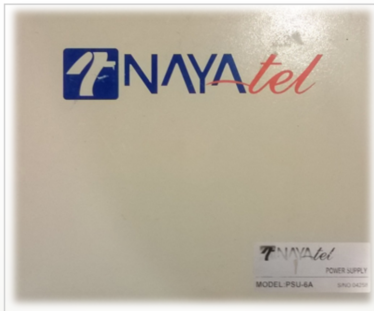
Top View of NAYAtel 70W UPS provided by NAYAtel

Depending on need of customer; ONLY ONT and router can be connected with this UPS (please note that both ONT and router can be connected with this UPS)